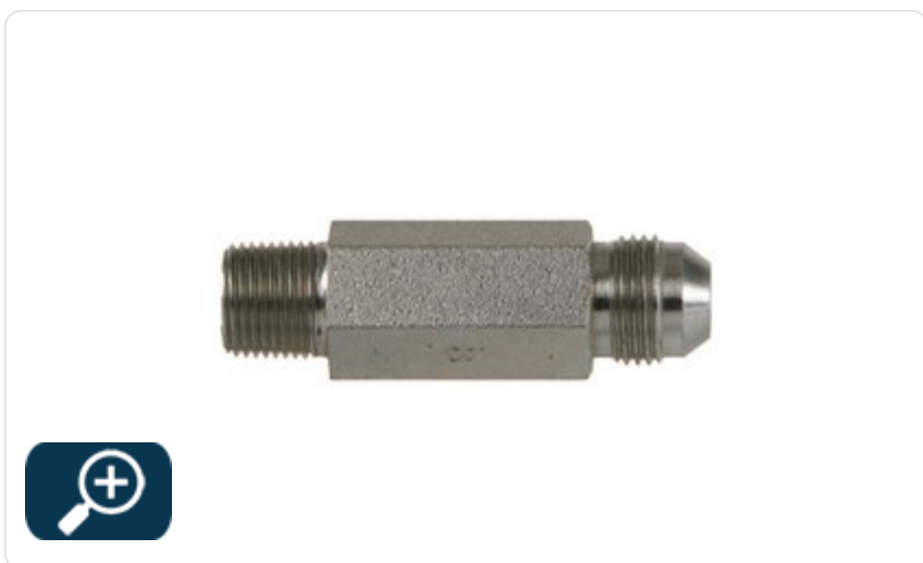
(1) JIC Male, (2) NPTF Male