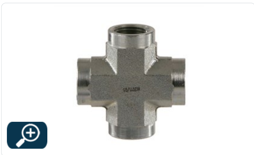
(1,2,3,4) NPTF Female